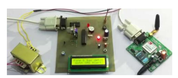
Fig.4.1. Hardware kit.

We have used various components in the IOT and Arduino based FIRE AND GAS leakage detection system. FIRE AND GAS Gas Sensor is used to detect the gas leakage. Arduino is used to turning ON the buzzer, to send a message to LCD and to send data to the IOT module. LCD is used to display an informative message. A buzzer is used to signal the gas leakage. And ESP8266 is used to send data over a Wi-Fi network.