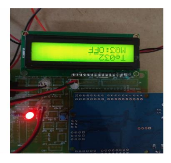
Fig.2. LCD display parameters.