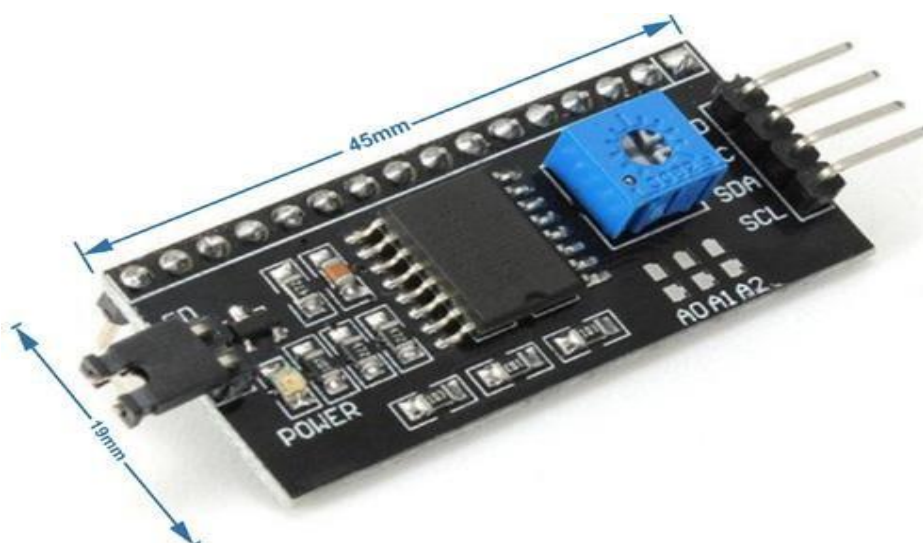
FIG. 3: 2D Model of I2C Serial Interface Adapter Module

Below is the 2D model of the I2C Serial Interface Adapter Module along with its dimensions in millimetres. The following information can be used to design custom footprints of the module for PCB designing and CAD modelling.