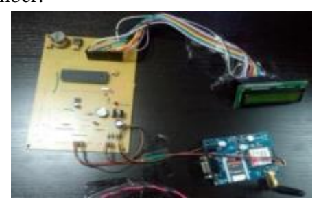
Fig.1. Hardware module.

It uses LPG gas sensor to detect the gas leakage. If there is leakage then buzzer is turned on. Specially in the cooking gas industry they have to be very careful with whatever their are working or designing. Because there are thousands of pipes that bypass the LPG gases from inlet of pipe to another outlet of pipe. If there is leakage in the pipe due to any reasons in the night time or any time there might be chances of getting major incidents of end of workers. This system can protect the workers all damages. Sending of data will be there if the gas is leakage on the registered mobile number.