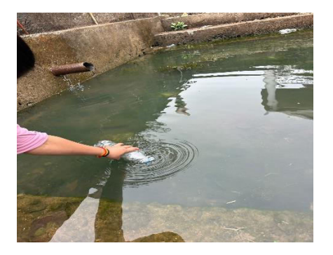
Figure 2: Water sample collection from the Wainganga River for limnological analysis.