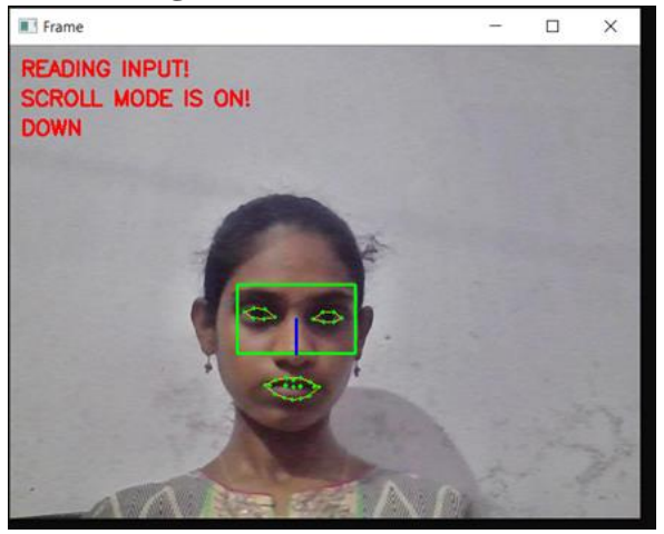
Fig.4.2. Detection of Eyeball.