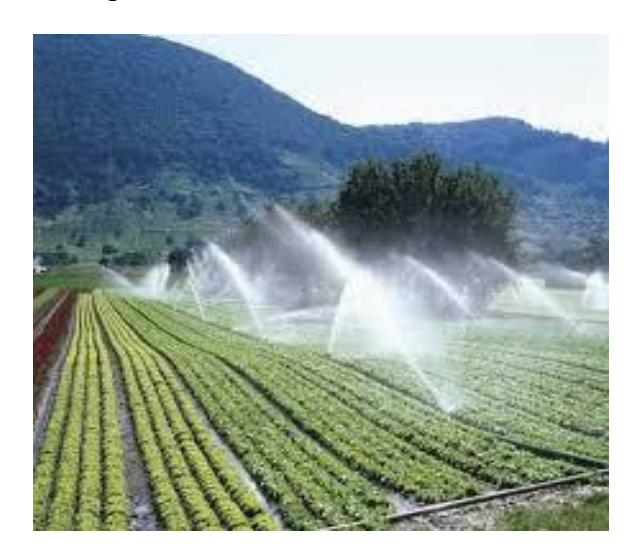
Figure 1: Fully Automated Irrigation System.

in climatic conditions; high and low rain fall and also the timing of the rain, storms and heat waves, and effects of cold, etc. For these conditions, traditional farming techniques are not appropriate. To minimize these effects and increase the productivity of agriculture, automation and IoT techniques are required.