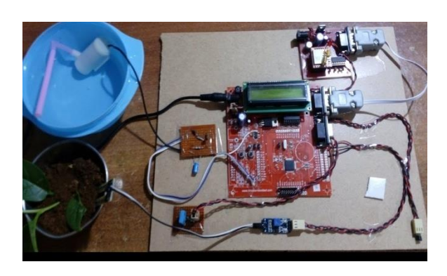
Figure 4: Output Results.

well connected with the microcontroller. Microcontroller received the data from the sensors and checks the threshold values. Then according to the threshold values, it takes the needful action and also informed the farmer by the message. The all the process completed by the GSM module. Nowadays, the culture of the poly house increasing day by day because in the poly house setup we can control the temperature, humidity, pest attack, and irrigation process. By smart farming, we can also minimize the human efforts to maximize productivity.